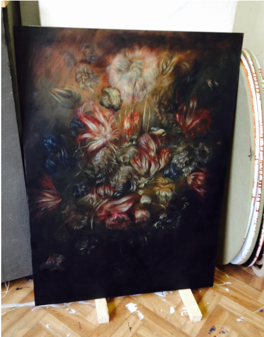
Studio view (work in progress)