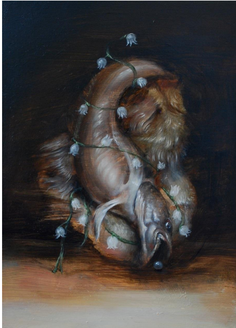
Pearl, 22x27cm, oil on panel, 2015