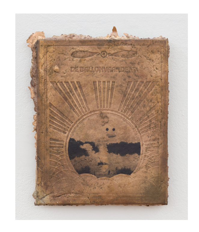
"De Balonvaarders III", 2022